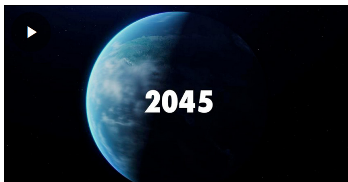
UN75: The Future We Want, The UN We Need

The United Nations is turning diamond during a novel period that calls for greater global solidarity in our quest for a better world. In 1945, global leaders — in response to World War II — convened to establish the United Nations to avert potential calamities by maintaining international peace and security, developing friendly relations between nations, supporting international cooperation, and harmonizing action to ensure stability. Since then, the curve has grown steeper for the UN as its mandate keeps increasing to cater for emerging dynamic natural and man-made global changes. Guided by a charter which established the purposes, governing structure, and overall framework of the organization and its structure, the work of the UN has evolved over the years in response to its growing mandate. Despite the criticisms and challenges it faces, the UN — including its workforce and its agencies — has effectively saved millions of lives; it has also won countless awards including Nobel Peace Prizes for its humanitarian and developmental interventions.