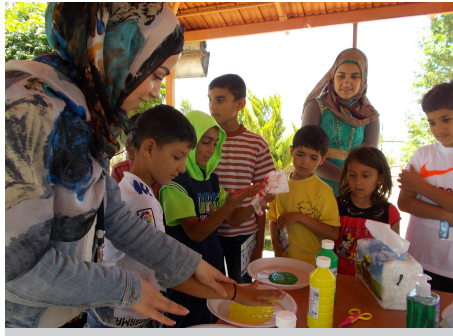
Hygiene promotion activity for children - Kfarseer, 2015

Since 2013, UN-Habitat Lebanon built on its experience in capacity building for municipalities towards efficient local authorities and reliable partners and launched the "Enhancing the Role of Unions of Municipalities to Respond to Refugees' & Host Communities' Needs" project. The aim of the project is to support the accommodation process of refugee families through the active involvement of municipalities and unions of municipalities in identifying, assessing and facilitating sound shelter facilities that comply with UNHCR standards and norms. Furthermore, the project supported host communities through the implementation of sound projects that would