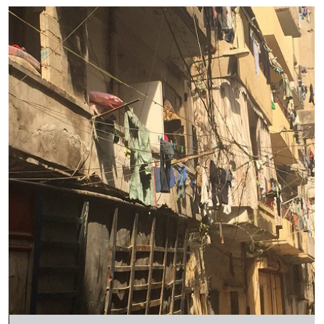
Naba'a - Bourj Hammoud - Beirut, 2015

Improvements in the policies, plans and strategies in the local and national governments can also