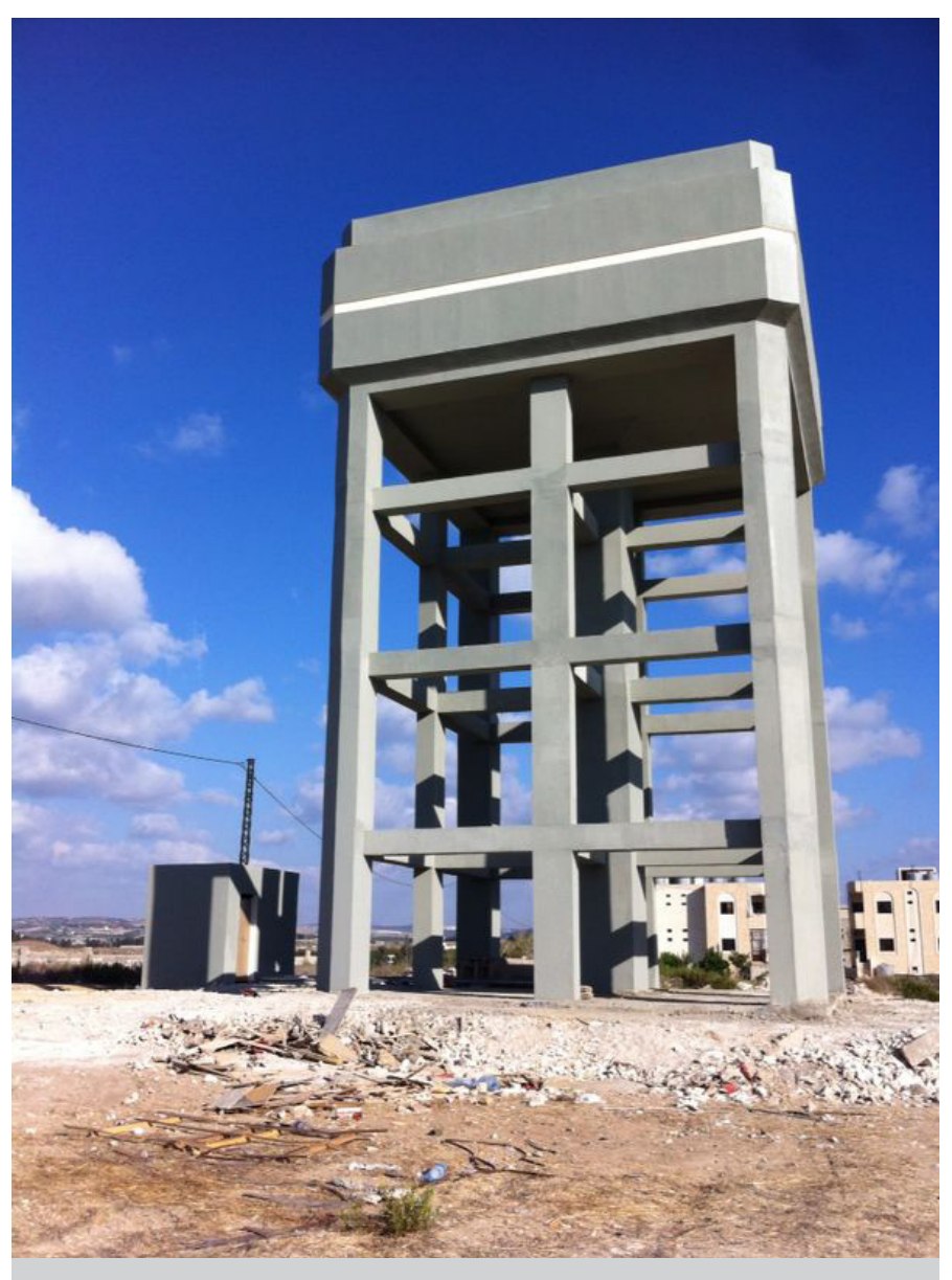
Water reservoir implemented in Ansarieh providing one of the basic needs

There is a need to regionally address common issues that are affecting most of the Arab Countries, such as, the migration to cities, the refugee crisis, water scarcity, etc.