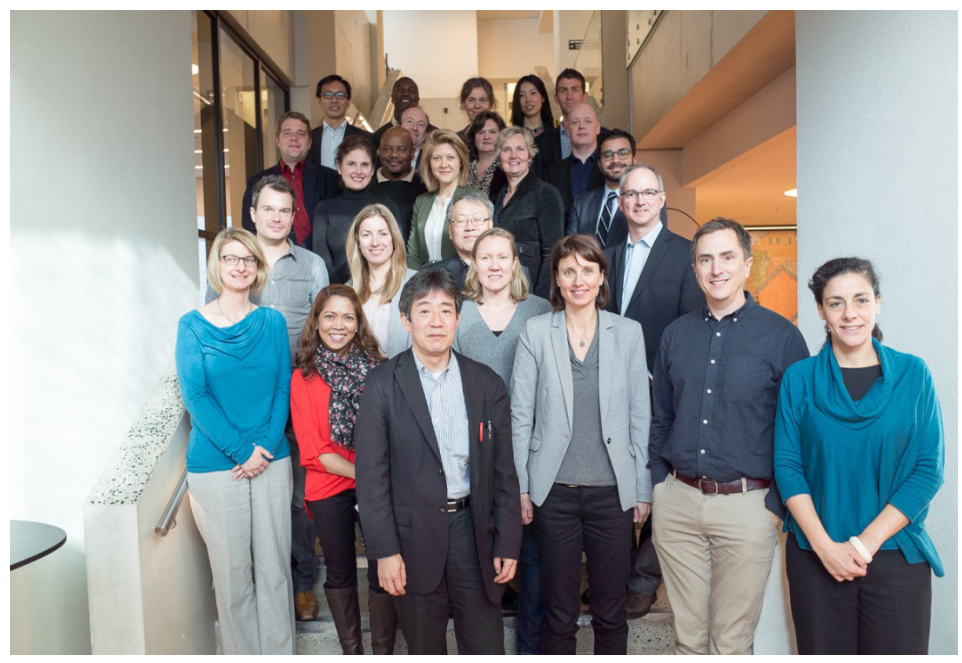
Participants at the Oslo workshop