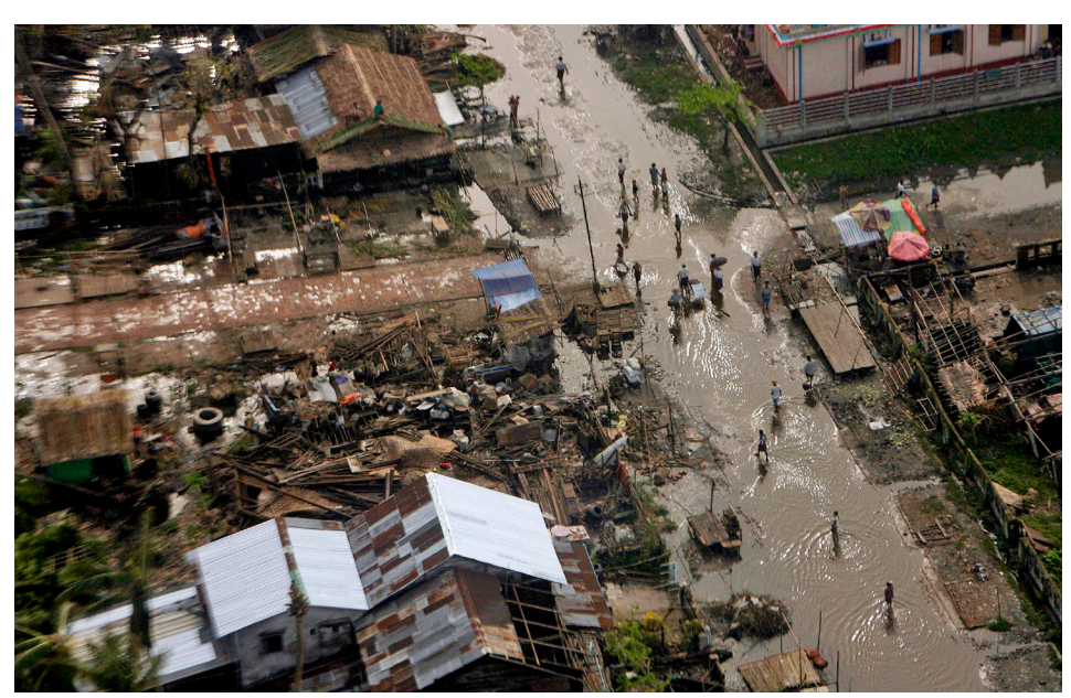
An aerial view of the damage caused by Cyclone "Nargis" in the Ayeyarwady delta region, west of Yangon, Myanmar, in May 2008.