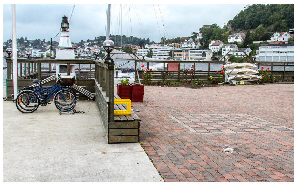
Among the cities represented at the Oslo meeting was Arendal, Norway. Arendal has reported a 79 per cent reduction in emissions from base year 2007.

For more information on these and other initiatives visit http://unhabitat.org/urban-initiatives/cities-and-climate-change-initiative/