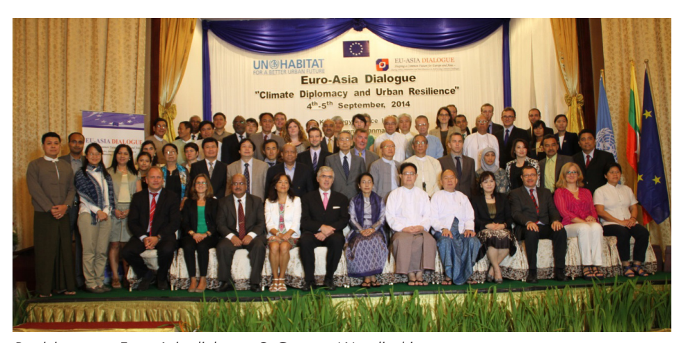
Participants at Euro-Asia dialogue